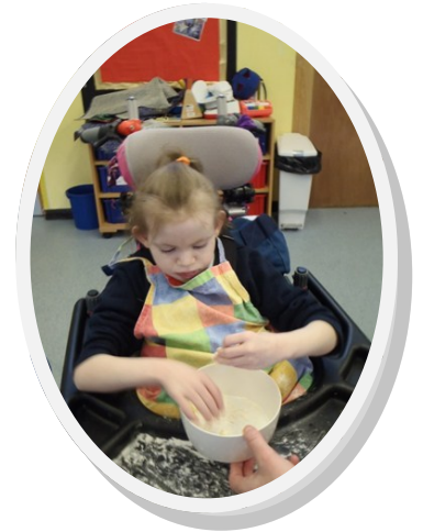
Edeve rubbing in