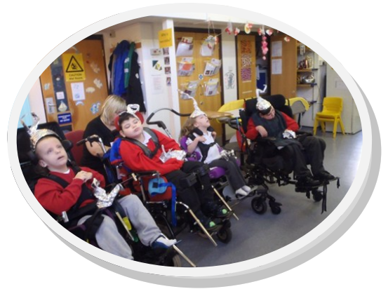
The astronauts prepare for take off!

Children in Penguin Class have been really enjoying their Space and Sky topic this term. Recently they have been listening to space music and making rockets and space helmets!